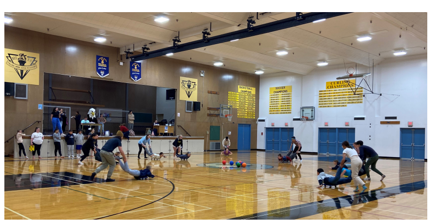
Frosh Week "Hungry Hungry Hippos" game!

For more information please see the bulletins posted at MEMSS or inquire at the office!